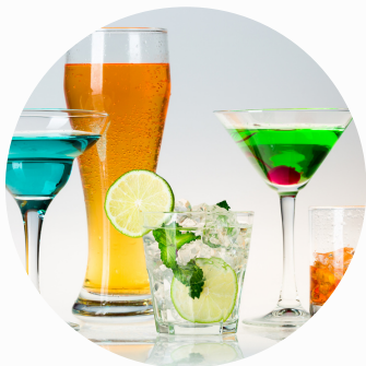
Libations or Sacrament