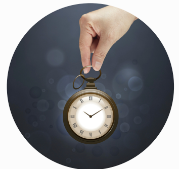
Timeframe or Outcome