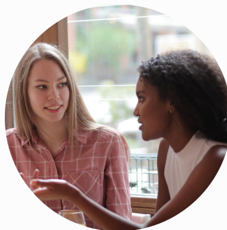
Ask for your desires and what you want